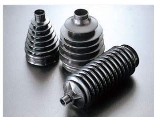
Lighter weight and higher function supporting EVs High-Performance Plastics