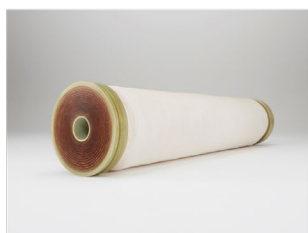
Solution of global water problems, such as desalination of seawater Water Treatment Membranes