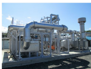
Global environmental conservation by purification and recovery of factory effluents Environmental Solution Devices