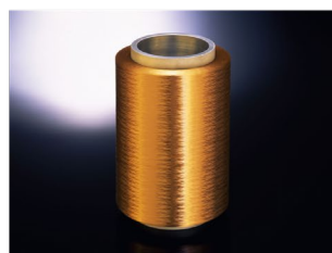
Growth of renewable energy by usage in offshore floating wind power generation Ultra-High-Strength Fibers